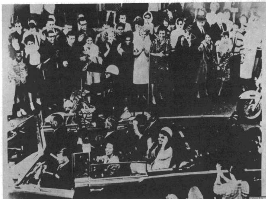
JFK EXHIBIT F-13

Mr. CONNALLY. "Take your glasses off, Jackie." She kept them off for awhile and she just unconsciously put them back on.