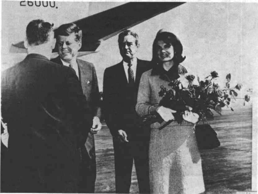
JFK EXHIBIT F-12

Dallas, the Sun broke through, it was absolutely marvelous weather, could not have been better.