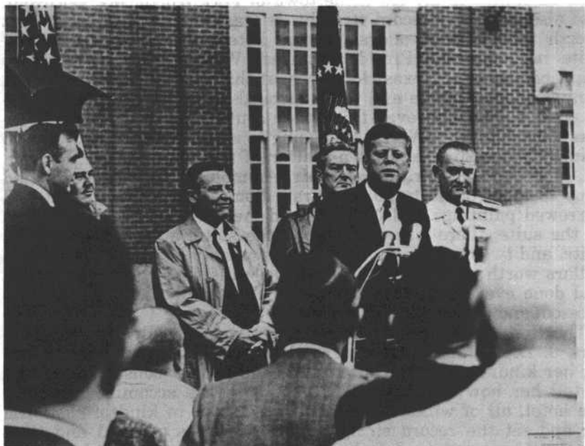
JFK EXHIBIT F-11

Mrs. CONNALLY. He came first and made the statement that Jackie was pulling herself together and then turned to Vice President Johnson and said, "Lyndon, nobody pays any attention to what we wear," which I thought was funny, didn't you?